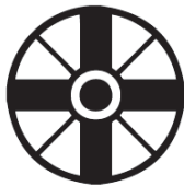
(24) THE CHURCH OF WORLD MESSIANITY