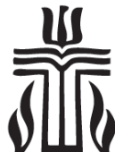
(33) PRESBYTERIAN CHURCH (USA)