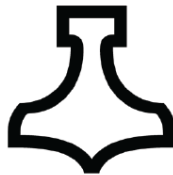
(55) HAMMER OF THOR