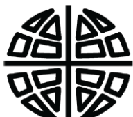
(72) EVANGELICAL LUTHERAN CHURCH