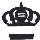
(78) Kingian Faith