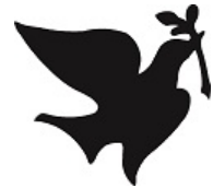
(77) Dove of Peace