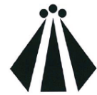
(65) DRUID (AWEN)