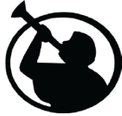
(11) MORMON (ANGEL MORONI)