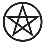
(37) WICCA (PENTACLE)