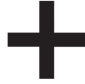
(14) GREEK CROSS