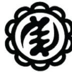
(63) AFRICAN ANCESTRAL TRADITIONALIST