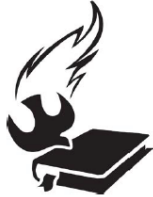
(54) CHURCH OF NAZARENE