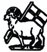
(27) UNITED MORAVIAN CHURCH