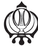
(36) SIKH (KHANDA)