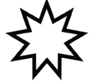
(15) BAHAI (9-POINTED STAR)