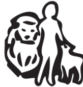
(20) COMMUNITY OF CHRIST