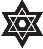
(3) JUDAISM (STAR OF DAVID)