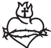
(62) SACRED HEART