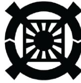
(56) UNIFICATION CHURCH