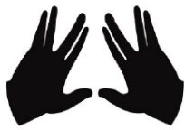
(45) KOHEN HANDS