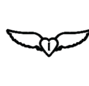
(21) SUFISM REORIENTED