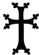
(42) ARMENIAN CROSS