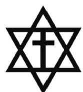
(44) MESSIANIC JEWISH