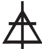
(26) CHRISTIAN REFORMED CHURCH