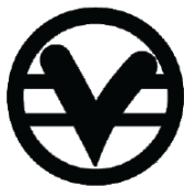
(25) UNITED CHURCH OF RELIGIOUS SCIENCE