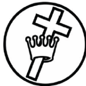
(47) FIRST CHURCH OF CHRIST, SCIENTIST (CROSS & CROWN)