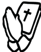
(74) FAITH AND PRAYER