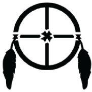
(53) FOUR DIRECTIONS